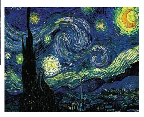
Some art-work using nature's shapes as inspiration